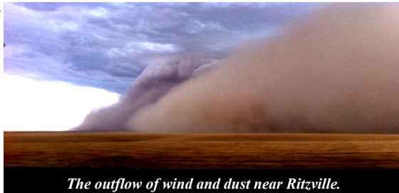
The outflow of wind and dust near Ritzville.

On August 25, 2013, a strong cluster of thunderstorms developed over Central Oregon and quickly moved into the Lower Columbia Basin, gaining strength and forming a line. These storms continued to push into the Central Columbia Basin where they expanded and appeared like a strong squall line. As they approached the Adams county line, storms stretched from near Moses Lake east to the State Route 195 corridor. A strong gust front developed out ahead of the line of storms, with gusty winds and heavy rain being the main weather threats. The storms pushed through the Columbia Basin and into the Spokane Metro Area, bringing winds of 62mph to the NWS Office and 61mph to Fairchild AFB. Winds to the west at Spring Canyon RAWS