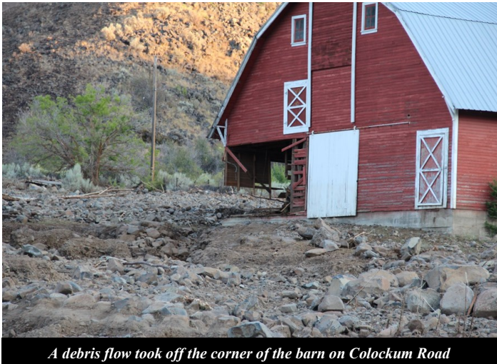
A debris flow took off the corner of the barn on Colockum Road

Answer: 90 Degree Days in 2013! Spokane: 23 (average 17), Lewiston: 56 (average 39), Wenatchee: 39 (average 32)