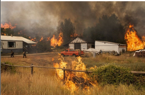
Twisp River Fire near Wenatchee—August 21, 2015