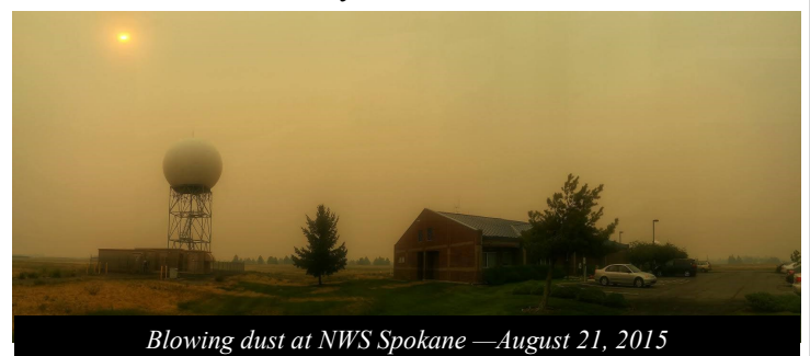
Blowing dust at NWS Spokane—August 21, 2015