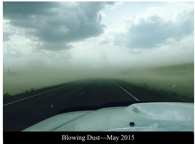
Blowing Dust—May 2015

Sound plausible? Well maybe, Yes. America's wireless industry is helping to build a Weather-Ready Nation through a nationwide text emergency alert system, called Wireless Emergency Alerts (WEA), which will warn you when weather threatens. In fact, NWS Spokane activated the WEA twice this summer for Dust Storm warnings in the Columbia Basin. If you were driving across I-90 at that time, your phone probably alerted you on the gusty winds and blowing dust. ☼ Greg Koch