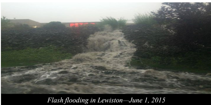
Flash flooding in Lewiston—June 1, 2015

The month of June started off innocently enough. A cold front on the 1 st brought heavy rain to the region with thunderstorms producing flash flooding. Hayden, ID measured 3.25-4.75” of rainfall, while Colbert, WA picked up 2.28”. Lewiston had 0.70” of rain in 30 minutes which led to significant flooding. After a few cool days behind this