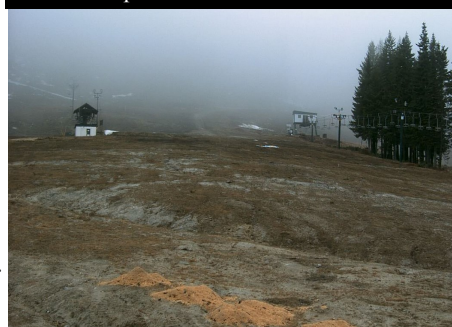
Mt. Spokane Ski Base on 3/17/15

The Climate Prediction Center has updated their spring outlook for March-May 2015. It calls for continued above normal temperatures and a better chance of at or below normal precipitation. ☀ Jeremy Wolf