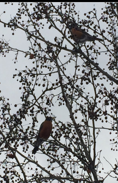
Robins spotted in early January at the NWS Spokane office. Was this early for Spokane? It's possible they knew more of our weather than we did.

Leavenworth picked up 4 to 6 inches of snow, followed by an inch of freezing rain which brought down trees and power lines. The next ten days were quiet with cool temperatures. A couple of stronger storms moved through the region in the middle of the month, bringing 2-5" of snow to the northern valleys and Cascades. Leavenworth and Plain picked up 7 to 10" of snow. Then the month of January ended on a quiet and uneventful note.