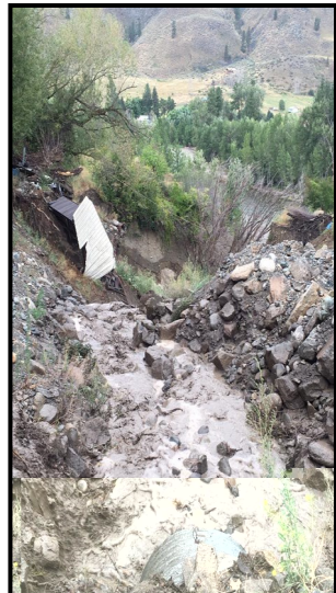
Flash flooding & debris flows in Cascades, July 22nd