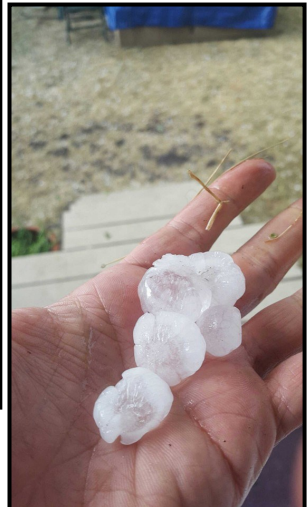
Hail on South Hill Spokane, July 22nd