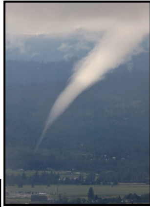
Funnel Cloud near Stataline, June 11th

ENSO Neutral conditions. The long range winter outlook is leaning toward a better chance of above normal precipitation and a better chance of below normal temperatures, especially for the later half of the winter. Updates on the winter outlook will be in the next newsletter, but until then follow along at www.cpc.ncep.noaa.gov .