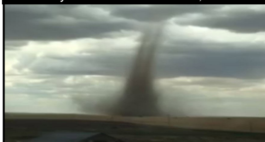
July 22nd Tornado near Mold, WA