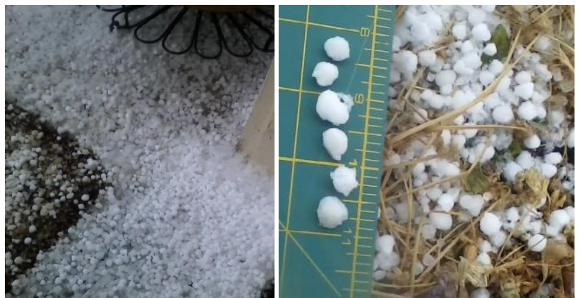
Spotter reports of hail on 10/13/17 from Whitman #43. Thanks for sharing!

Winter spotter training was in full swing this fall with over 100 new and current weather spotters receiving training. Do you still need to brush up on your training? The NWS Spokane web page has many options on the Spotter Resources section. Look under the Local Programs tab for the NWS Weather Spotter Program at https://www.weather.gov/otx/Spotter_Resource_Page . You will find a recording of the Virtual Spotter Training that will take you to the NWS Spokane YouTube channel. There are also links to three Spotter training modules from the COMET MetEd training site. Links to the Weather Spotter Field Guide and Sky Watcher Chart are available too. Once you complete any of the online training, just email us at nws.spokane@noaa.gov and we will mark you down as a trained weather spotter. Happy Spotting! ☀ Robin Fox