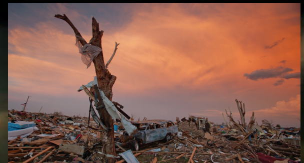
After a tornado, watch out for dangerous debris such as sharp metal, glass or downed power lines.

For more information, visit weather.gov/safety/tornado