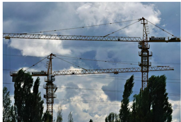
Figure 3: Cranes are especially vulnerable to lightning.

Employers should also post information about lightning safety at outdoor worksites. All employees should be trained on how to follow the EAP, including the lightning safety procedures.