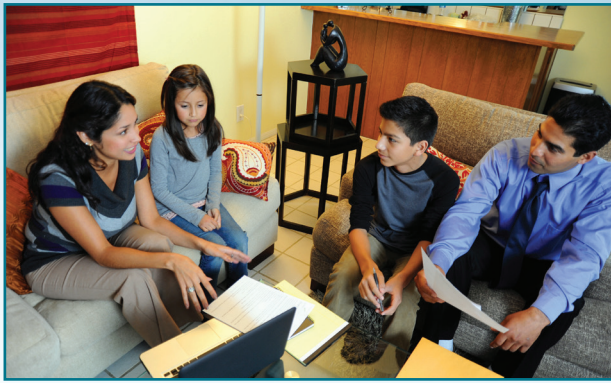
Discuss your plan with your loved ones.

If you are visiting the coast , find out about local tsunami safety. Your hotel or campground should have this information.