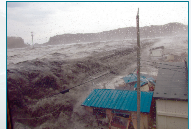
Tsunami striking Miyako City, Japan (2011).

For more information, visit www.weather.gov/tsunamisafety