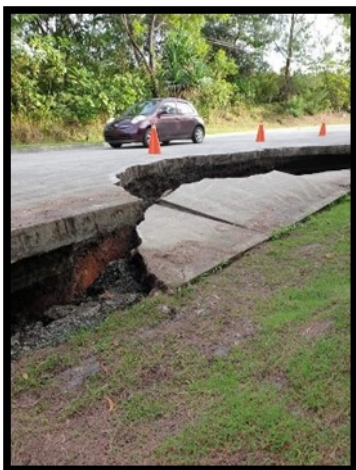
Damage to pre-cracked road in Airai from May 1 st rainfall.