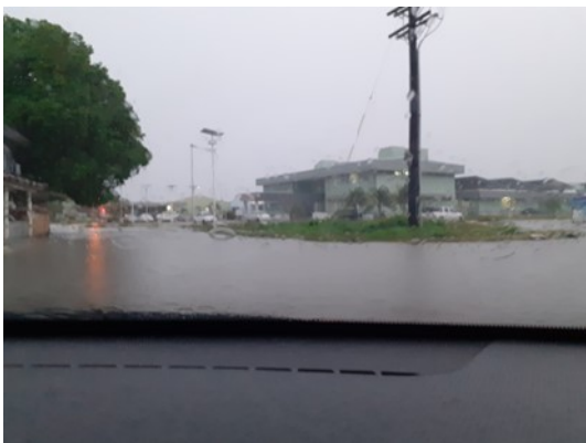
Figure 1: Road to the hospital

We had advisories on high surfs and possible inundation at Majuro during February and this month due to the northern swells, but no inundation was observed.