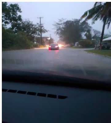
Figure 2: Road to the College