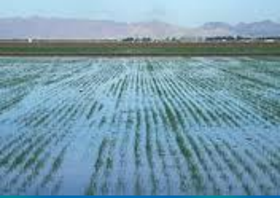
Surface irrigation system