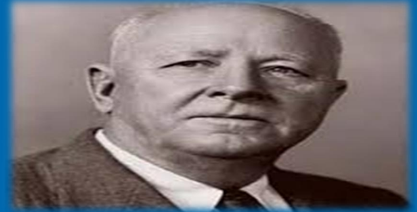
Founding Father: Hugh Hammond Bennett