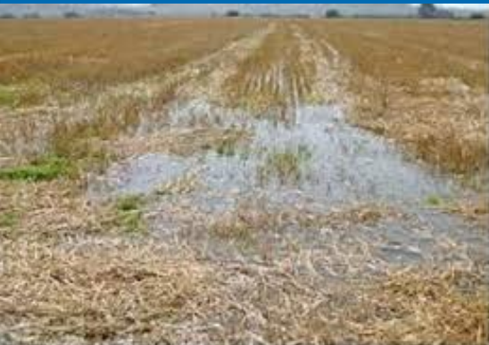
Irrigation with residue