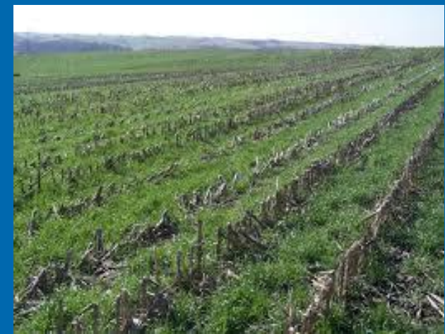
Conservation cover crop