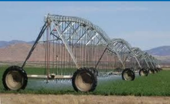
Air Quality Pivot irrigation