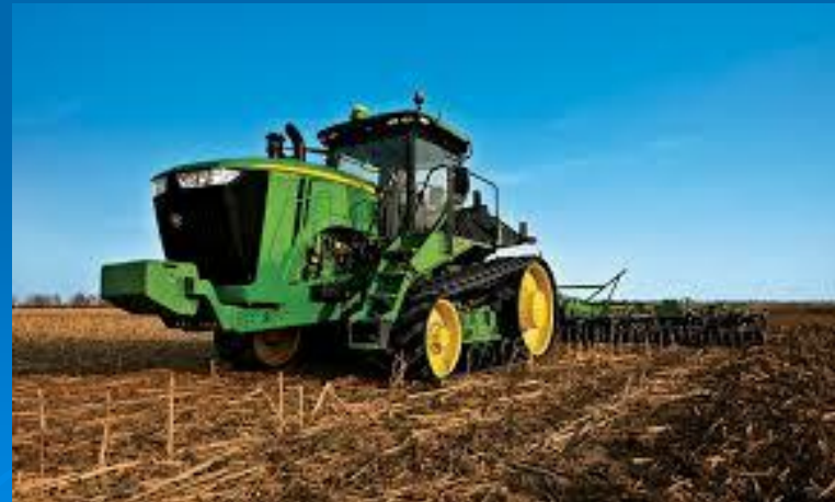
Combustion System Improvement