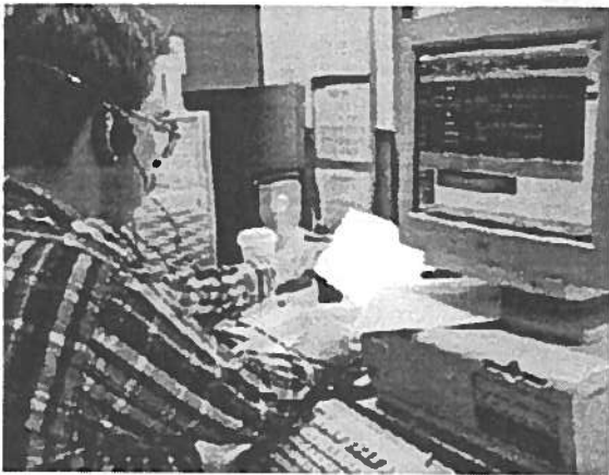
During the 4 hours the test watch was in effect, a SKYWARN spotter exercise was held, testing a new voice and packet amateur radio station at WFO Reno.

On Friday, May 3, the Storm Prediction Center issued a test Severe Thunderstorm Watch for Nevada. This was followed by a test Redefining Statement (SLS) product from Reno containing a few lightning safety tips. These tips were repeated in an Emergency Alert System (EAS) Re-