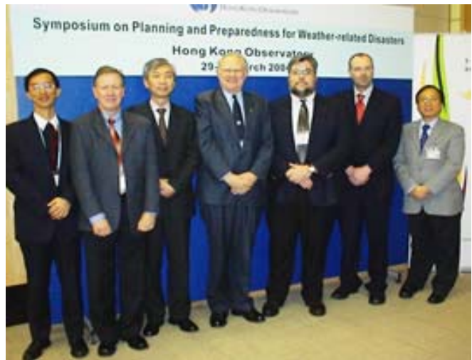
Symposium on Planning and Preparedness for Weather-Related Disasters in Hong Kong.

At the end of the symposium, I also took part in a discussion forum to address questions posed by the approximately 60 attendees. In addition to Hong Kong