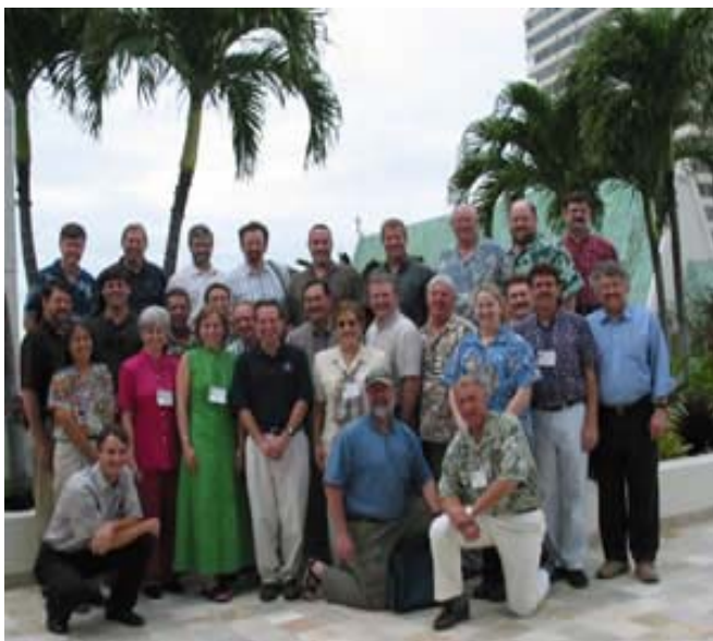
2004 Tsunami Coordination Meeting attendees.

The emphasis was on getting all the key people in the tsunami warning program together. In NWS, this meant everyone from field WCMs to national headquarters. It also meant bringing in key people outside NWS: emergency management officials, primarily state-level, and other government organizations with interest in the program such as FEMA, the U.S. Geological Survey and the NOAA Ocean Service.