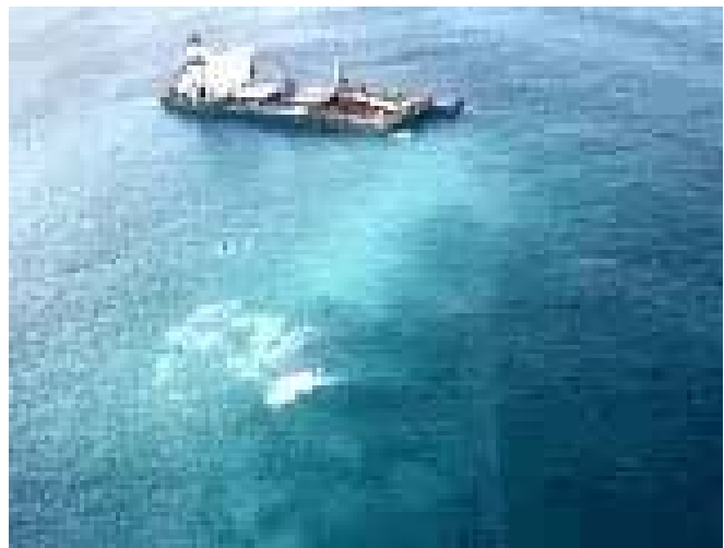
Selendang Ayu sinking with its load of crude oil.