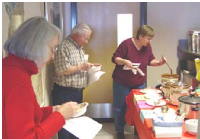
Emergency Coordinators sample the chili.

Have you ever dreamed of combining the cold of winter with the heat of the southwest? WFO Pocatello, ID, used the unusual duo to draw media, Homeland Security Staff, Natural Resources Conservation Service and EM managers to its second annual Groundhog Day Chili Cook-Off Contest and Hydrologic Outlook Briefing on February 2.