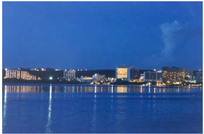
Guam's beautiful Pacific shoreline at night.

NOAA has developed a new rip current brochure in English and Spanish, outdoor information signs for posting by municipalities along boardwalks and beachfronts and a website full of rip current information, links, photos and templates for brochures and signs. Help us spread this lifesaving information to others. You can access the website at http://www.ripcurrents.noaa.gov . ✱