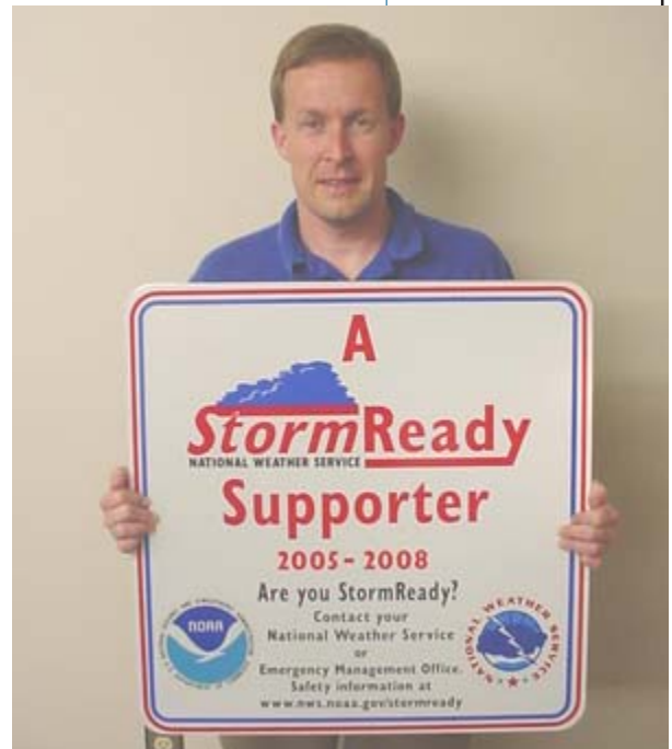
NWS now offers the option of s StormReady Supporter sign as well as the community and county signs.

Huntsville staff members plan on continuing the StormReady Supporter project throughout their 14 counties, specifically targeting large factories, universities and other significant partners, including media, within each of the counties. ❄