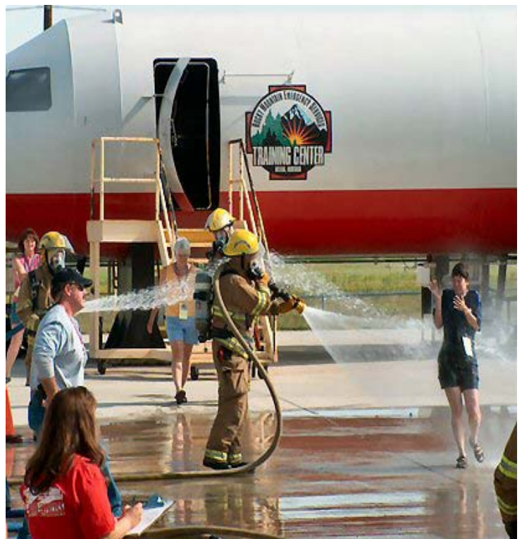
A "victim" is sprayed with decontaminant after being subjected to a biological agent released onboard a plane during Operation Last Chance in Helena, MT.

"A cold front and weak shortwave approached the area by late afternoon and convection developed over the Elkhorn Mountains by 2 p.m. Around 3 p.m. an initially weak cell moved into the valley and intensified as it moved over the incident location around 3:15