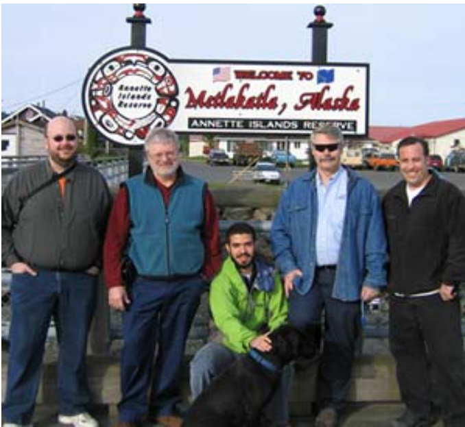
An interagency team toured portions of Southeast Alaska recently to conduct tsunami outreach.