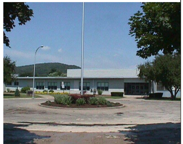
Charles F. Johnson Elementary School in Endicott, NY