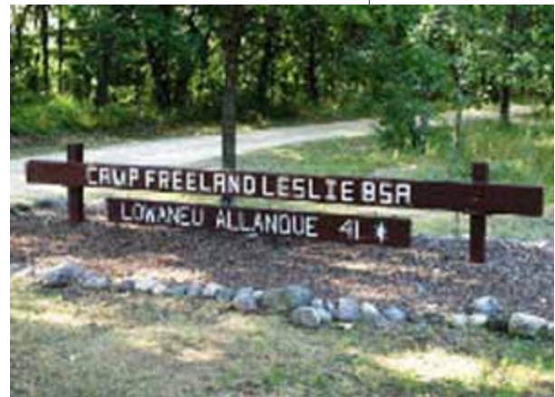
The StormReady programs helped prepare Boy Scouts for severe weather at Camp Freeland Leslie thanks to StormReady.