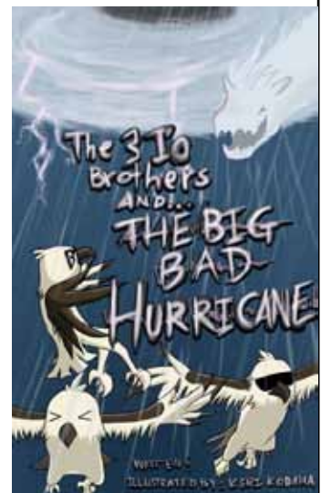
The 3 'Io Brothers and the Big Bad Hurricane , a new children's book, helps bring hurricane safety to kids.