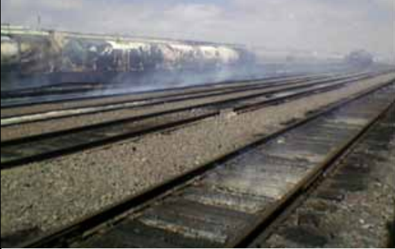
Top: Emergency Preparedness Day attendees visit the NWS Amarillo, TX, booth. Bottom: Rail cars and HazMat spill shortly after the fire was extinguished.