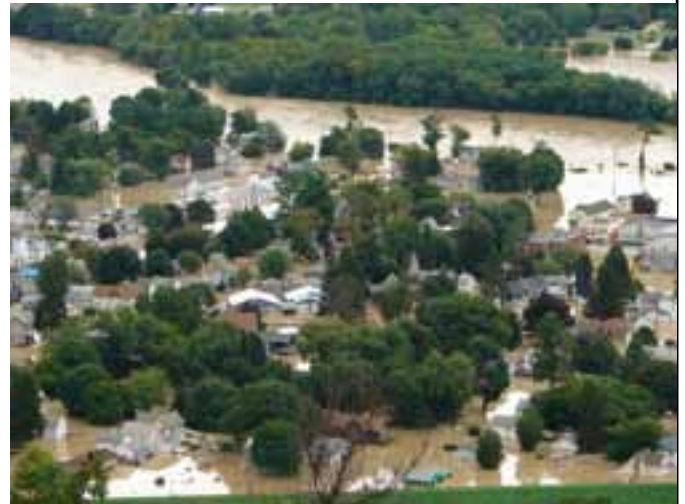
Athens area under water.