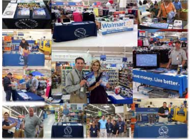
WFO Brownsville, TX, staff go to Walmart to explain hurricane safety and pass out the 2011 Texas Hurricane Guide.

WFO Brownsville/Rio Grande Valley's partnership with Walmart provided critical hurricane preparedness information to residents of the Rio Grande Valley by distributing hundreds of thousands of free guides in English and Spanish. The Texas Hurricane Guide helps NWS reach deep into a unique culture that includes numerous vulnerable communities. The guide is one step on the path to building a Weather-Ready Nation through preparedness education for the varied needs of different groups. ☼