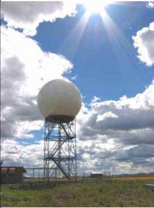
Spokane, WA, dual pol radar

Senator Cantwell was the first leader in “the other Washington” to be convinced of the need for the coastal radar and to make it a priority. In 2007, she asked the NWS to commission a third-party study, released in May 2009, that demonstrated the gap in Washington’s weather radar coverage. She secured the resources for this radar system through a down-payment in NOAA’s 2009 appropriations and then helped get the full funding included in the NWS 2010 budget. This radar is the fruit of the tireless efforts of Senator Cantwell and others in Washington.