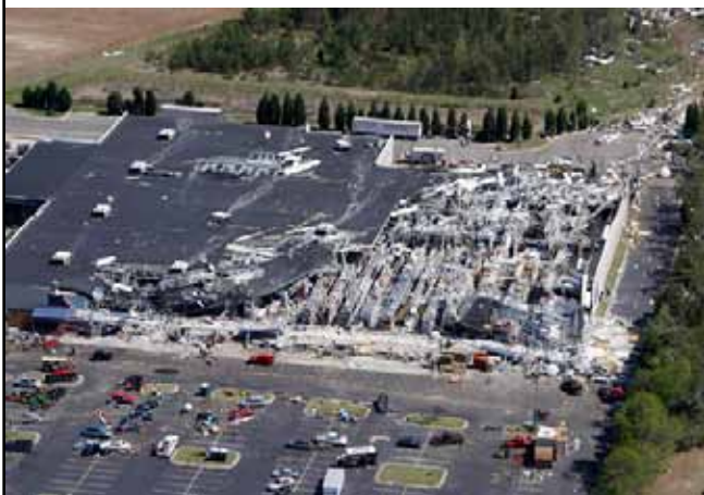
Lowes Home Improvement store after it was hit by a tornado in Sanford, NC, April 16, 2011.

In the Lower Mississippi RFC's hydrologic service area alone, record levels were equaled or set at 16 river forecast locations, with 28 sites experiencing major flooding, 25, moderate flooding, and 33, minor flooding. Many WFOs shifted staff to long-term significant hydrologic operations, particularly WFOs Paducah, KY; Memphis, TN; Jackson, MS; Lake Charles, LA; and Slidell, LA. The NWS Performance Branch is reviewing the draft of this service assessment.