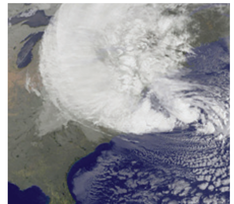
Hurricane Sandy battering the U.S. East coast on Monday, Oct. 29, 2012.

Unfortunately, 13 people were killed by the extreme winds, mainly by falling trees. An estimated 4 million customers lost power for up to a week. The region impacted by the derecho was also in the midst of a heat wave. The heat, coupled with