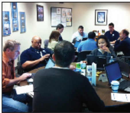
FEMA Watch Standers work on a data collection exercise to develop a resource report for a weather scenario.

Attendees represented the 10 FEMA regions and its headquarters. Feedback was overwhelmingly positive. One participant said she found the content practical and informative, but the opportunity to build contacts with NWS and colleagues in other FEMA