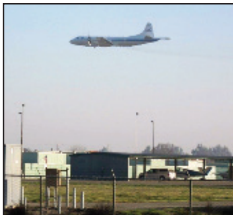
The NASA P-3B made low approaches at local airports during this mission, getting as low as 100 feet to make key air quality measurements.

This mission, part of a broader 4-year campaign to study U.S. air quality, focused on the San Joaquin Valley when air quality is reduced due to severe concentrations of fine particulate matter. The main objective of DISCOVERY-AQ is to collect and analyze data that will improve