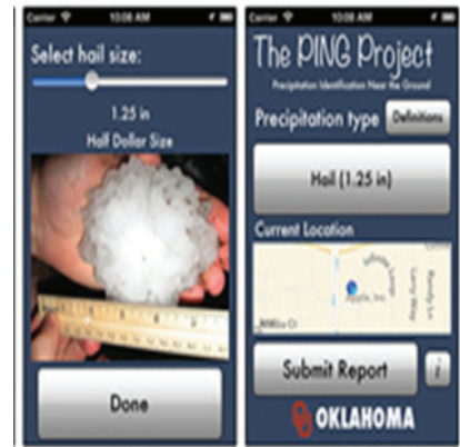
mPING weather reporting app

With the mPING app, anyone can send a weather observation on the go. The user simply opens the app, selects the type of precipitation that is falling, and hits submit. The user's location and the time of the observation are