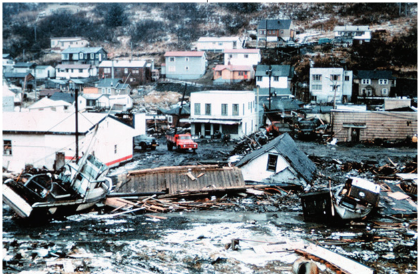
Tsunami damage at Kodiak, AK, after the 1964 Great Alaska Earthquake and Tsunamis.