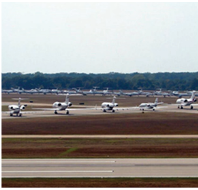
Overflow aircraft parking at Easterwood Field on September 14, 2013