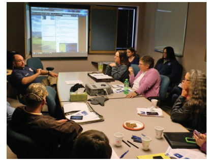
Participants at the Incident Command System Tabletop Exercise

Though this scene may be realistic for some summers in the NWS Riverton, WY, County Warning Area, (CWA), this was not a real incident. NWS Riverton created this scenario for a CWA-wide incident command system tabletop exercise last November.