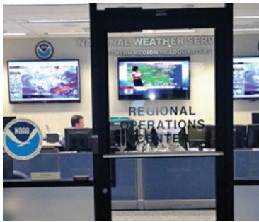
NWS Southern Region Regional Operations Center

partners. The duty ERS also provides projected weather impacts to FEMA Region VI for the coming week as well as climate/drought and space weather information.