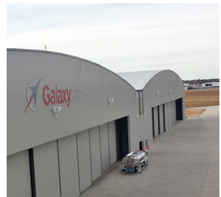
New Galaxy Fixed Based Operations at Lone Star Executive Airport

Lone Star Executive Airport is in Conroe, TX, about 40 miles north of Houston and 25 miles north of the Houston Intercontinental Airport. The field is home to several