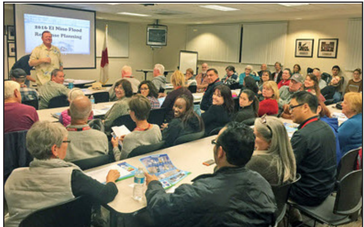
American Red Cross volunteers fill a room in Santa Ana to watch presentations on El Niño.

Two of the NWS sessions drew more than 300 people and many rooms were at capacity. Congresswoman Norma Torres hosted an open house with more than 100 attendees and a national webinar with nearly 4,000 attendees. Several of the briefings were followed by Table Top Exercises offering hands on experiences. We also created a YouTube Video with Caltrans . Despite this massive effort, NWS has had requests for more public and EM presentations, and has more sessions scheduled in January.