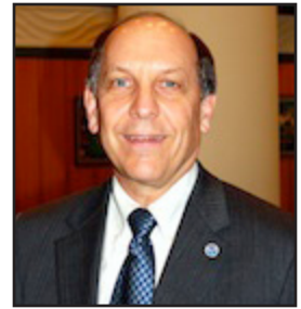
NWS Director Louis Uccellini

We established the Integrated Dissemination Program to transform the agency's dissemination capabilities from a collection of independent stovepipes to an integrated, enterprise-wide dissemination service. Early in 2014, NCEP Central Operations moved the IDP infrastructure to operational, bringing onboard a variety of dissemination applications. Along with this integration, the upgrade to the oneNWS network will help support the ingest and dissemination of higher-resolution data, including GOES-R data and numerical models.