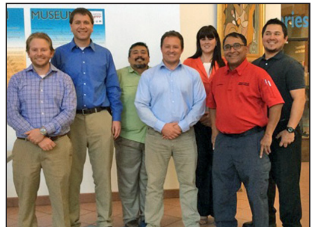
NWS, AZ DEMA, FEMA, BIA and Navajo Nation Emergency Services work to improve preparedness.

Long duration power outages are also common during and after severe winter weather events. Because of these outages, it is vital for residents to stock up on food, clothing and alternate sources of heating, such as wood and coal, to survive.