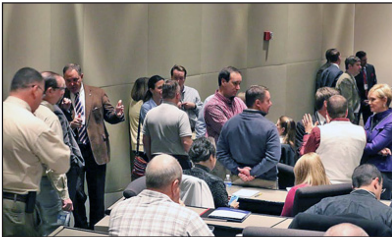
North and Central Georgia Integrated Warning Team at GTRI Conference Center, December 7, 2015