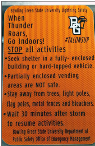
Lightning safety sign at Bowling Green University