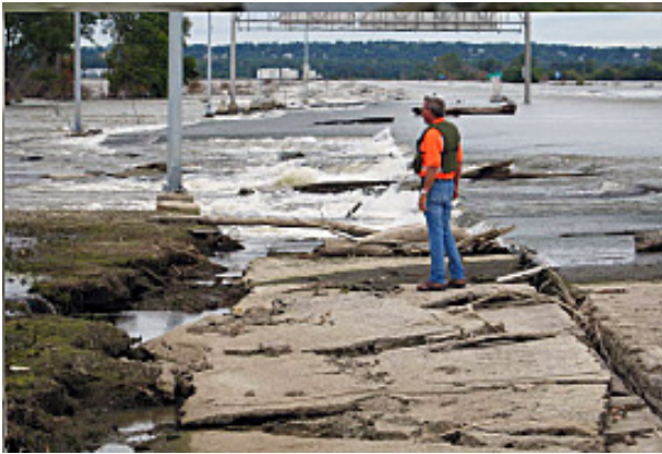
Damage to Interstate Highway 680 near Council Bluffs, IA. The Souris River crested in nearby Omaha, NE, at 36.29 feet on July 2, 2011, which was around 2 feet above the level shown on the photo dated August 16, 2011.