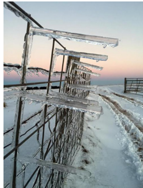
Christmas weekend storm in Oklahoma. taken near Fort Cobb, OK.

Since November’s Earth, Wind & Fire exercise, Oklahoma has experienced two major winter storms that struck on holiday weekends. The state was impacted with significant ice accumulations on November 27-28 and on December 26-27. There is no doubt that the operational readiness of both NWS meteorologists and first responders before these winter weather episodes was enhanced thanks to the unique opportunity offered by the Earth, Wind & Fire exercise.