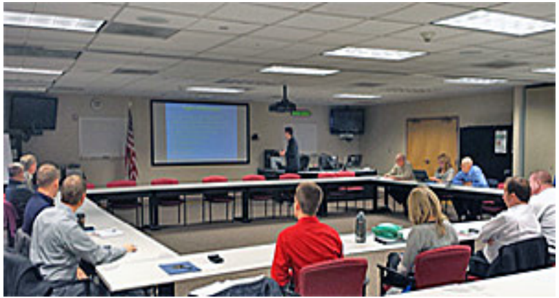
Attendees at the central Ohio Integrated Warning Team meeting focused on snow squalls and their impact on roads and other emergency services among many vital topics.

The feedback from the meeting was positive, and highlighted the need to effectively communicate a clear, consistent message for weather hazards and to work together to ensure these messages are delivered.