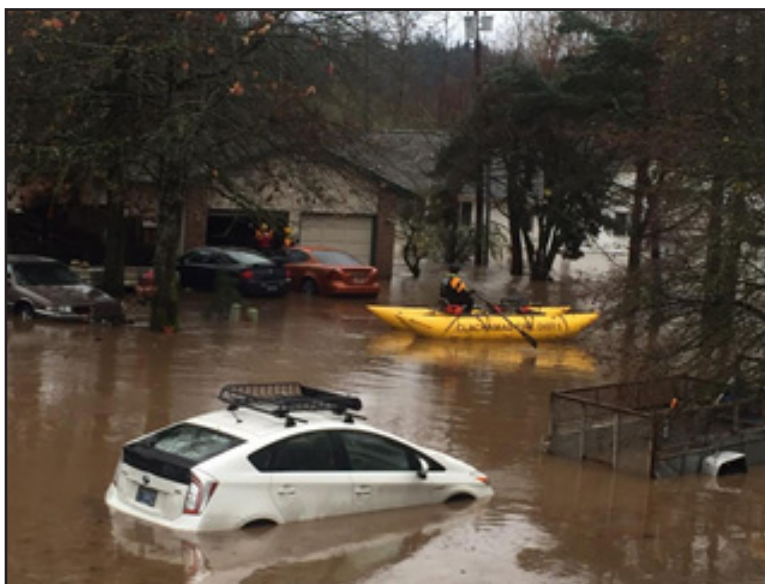
Record Flooding in the Pacific Northwest turned roads into rivers.

The event demonstrated the value of DSS provided by the NWS leading up to and during an episode of historic rainfall and flooding. Briefings, forecasts and other DSS provided by WFOs Portland and Seattle, assisted in evacuation decisions and life and property being saved. These WFOs worked with their emergency management partners and communities to build a Weather-Ready Nation.