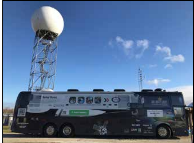
The STEM Shuttle near the NWS Green Bay WSR-88D.

STEM Shuttle instructors will work with the NWS over the winter to develop several weather activities.