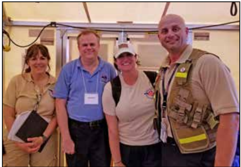
Sunshine Endeavor/Hurricane Thomas exercise with the Veteran's Affairs Department and South Florida Federal Executive Board

You can find more information about the Sunshine Endeavor exercise at Department of Veterans Affairs website. Preparing staff to provide different aspects of decision support can help form better relationships with all kinds of partners. Taking part in exercises like this better prepares NWS staff and introduces users to the full suite of NWS products.