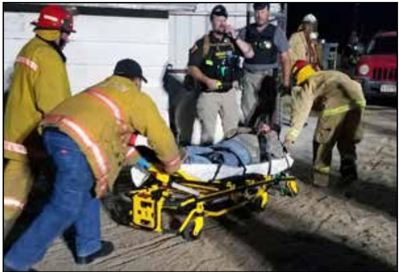
Logan County EMS joined forces with the Nebraska Emergency Management Agency to put together a tabletop exercise, which they followed with a full scale exercise

In this particular exercise, a bomb was involved so the NWS offered to run the Hybrid Single Particle Lagrangian Integrated Trajectory (HYSPLIT) dispersion model so law enforcement could focus its evacuations if the bomb contained a harmful gas or biological contaminant. The exercise participants also learned the NWS can and does mobilize to support local Emergency Operations Centers to keep a watchful eye on hazardous weather that may affect cleanup efforts. NWS also can provide an immediate Spot Forecast from the office in the event of an emergency. Working alongside the NWS during exercises helps us all support a Weather-Ready Nation as we learn how to best support one another before a disaster strikes.