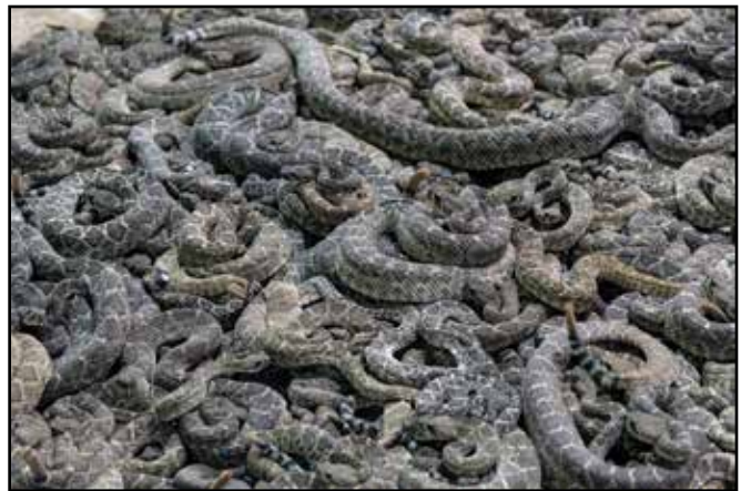
More than 30,000 visitors attend the annual Rattlesnake Roundup in Sweetwater, TX.

Although onsite support was only provided for 1 day, forecasters at the NWS office were ready to brief whenever needed. The Rattlesnake Roundup started back in 1957 to help local law enforcement with the rattlesnake population. This important community event has grown over the years, drawing a growing crowd of visitors.