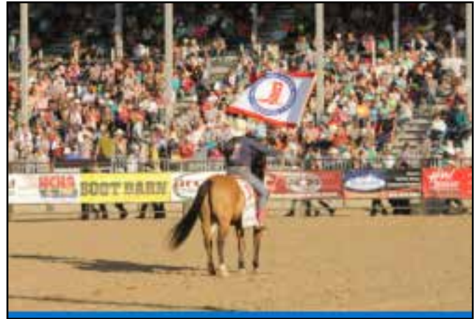
National High School Finals Rodeo Events: July 12-25 2018