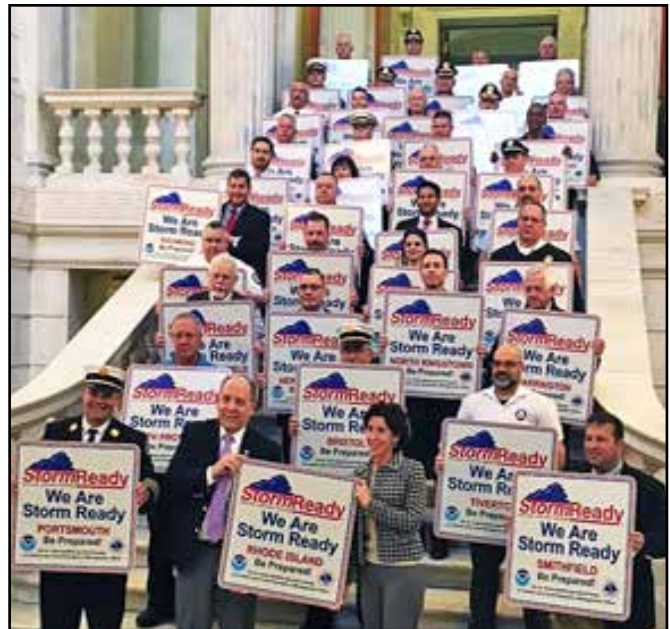
The StormReady recognition ceremony concluded with a dramatic photo session that featured representatives from all 39 communities holding their new StormReady signs.

The other StormReady states are Delaware, Florida, Hawaii (also TsunamiReady) and South Carolina. Guam and the Northern Marianas are also StormReady and TsunamiReady and Puerto Rico is completely TsunamiReady.