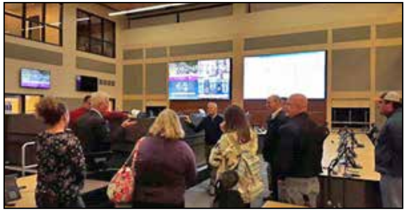
NWS Paducah, KY, staff visit the Kentucky State Emergency Operations Center in Frankfort, KY

The visit proved so helpful to both NWS and the Kentucky SEOC that NWS Paducah staff plan to visit additional state EOCs in the area in the near future.