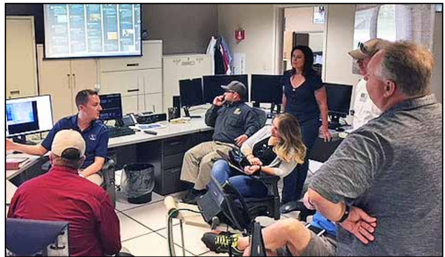
NWS personnel provide an overview of operations to emergency management, animal response officials and the Red Cross.

Each month, EMs in the southeast region of Kansas hold a meeting that includes EMs, a regional EM representative from the state, the Red Cross, other service organizations, a health care representative and the NWS. In May, the meeting was held at NWS Wichita. This meeting included a tour of the office, a demonstration of how we manage decision support services and a chance to watch the weather event simulator and hot spot notification tool, which is used to spot wildfires.