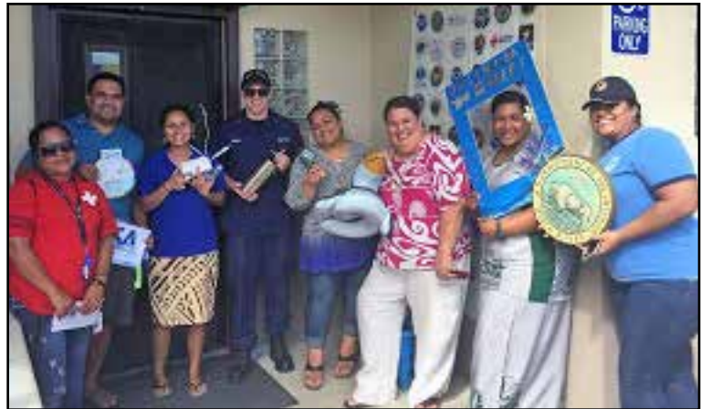
Weather Service Office Pago Pago Weather-Ready Nation Ambassadors help nurture the next generation of leaders.