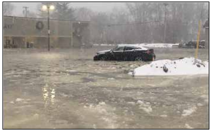
Ice jam flooding in Johnson, VT, along the Lamoille River on January 13, 2018

These workshops have proven beneficial for town and state decision makers as well as NWS Burlington by building new partnerships and trust and increasing the two-way flow of information and situational awareness.