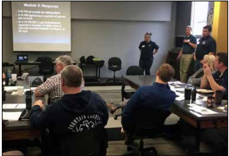
NWS works with EMs, school officials and local enforcement to help improve school in the event of a tornado.

As we continue to create a Weather-Ready Nation, activities like these become increasingly important because we learn how to better engage with our local emergency planners and improve safety plans. To build on this success, NWS Indianapolis is promoting the Weather Watcher program developed by NWS Chicago. This program involves training local officials and event decision-makers to become more weather-aware and provides them the resources to make the best decision possible. The Indianapolis office advertises this program with local partners and is developing additional exercises for partners.