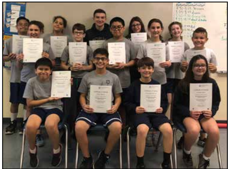
Middle school teacher encourages weather safety through WRN Ambassador program.”