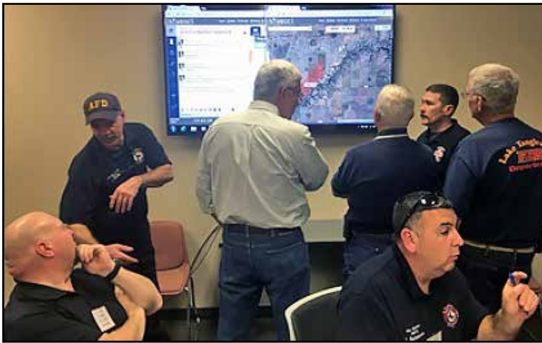
Mayors, Fire Chiefs and EMs discuss a simulated evacuation.