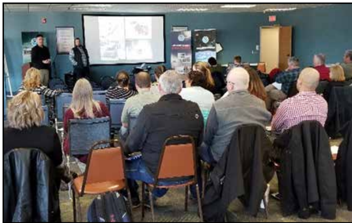
More than 60 emergency managers, coordinators, planners and first responders attended the NWS Pocatello, ID, EM workshop and chili contest.