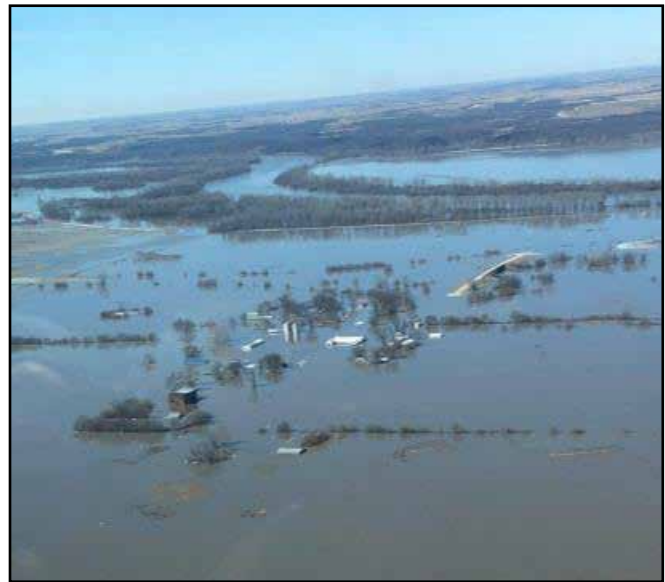
Flood in Freemont County, IA, March 2019

Users will see no change to the information in the FFW segment header block, including the Valid Time Event Code (VTEC) and Hydrologic VTEC (H-VTEC) strings. All NWS Weather Forecast Offices will issue FFWs in IBW format by late November 2019. FFWs will fall into three categories: