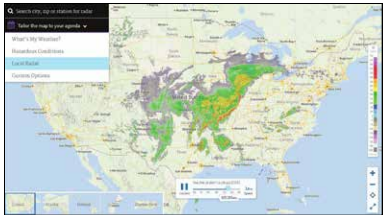
The new radar web interface in development