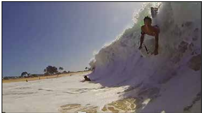
Riding waves can be fun but it can also be deadly. New NWS videos help beach goers understand the dangers before they go near the ocean.

Drowning is the third leading cause of unintentional injury-related death worldwide, accounting for 7 percent of all injury-related deaths, according to a 2017 report by the World Health Organization. The U.S. Lifesaving Association reports that between