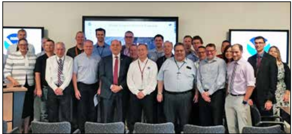
Key NWS staff from throughout the weather service met in May to refine winter weather products and messaging.

A primary discussion topic for the group was planning the testing phase of a proposed Weather Prediction Center (WPC) Probabilistic Winter Storm Outlook (WSO). The goal of this testing phase is to enhance decision making of Winter Storm Watches. This outlook highlights the probability of exceeding local warning criteria involving snow and ice amounts.