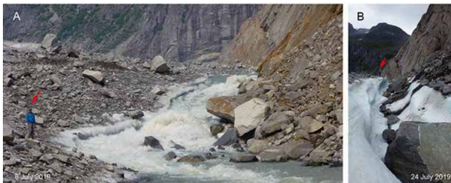
Left: Aaron Jacobs standing by a side channel that was formed when the water in Suicide Basin overtopped the ice dam before the drainage went sub-glacier. Right: Aaron at the same location, showing the ice erosion from the overtopping drainage.

Aaron took part in a multi-agency study of the basin that may help improve forecasting capabilities at other outburst flood areas around the state. “If it wasn’t for all these agencies coming together and working as one, it would have been a lot more difficult to put together this monitoring program and information database that we’ve gathered throughout these past 10 years,” said Aaron.