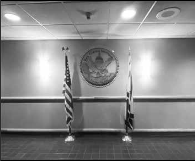
West Virginia Intelligence Fusion Center

The NWS partnership with the WVFC evolved from a conversation at a county meeting in 2017. Now, NWS Charleston has a seat at the WVFC weekly meetings, joining Fusion Center Analysts, along with representatives from the West Virginia Division of Homeland Security and Emergency Management (DHSEM), multiple state agencies, the Federal Bureau of Investigation and the Department of Homeland Security.