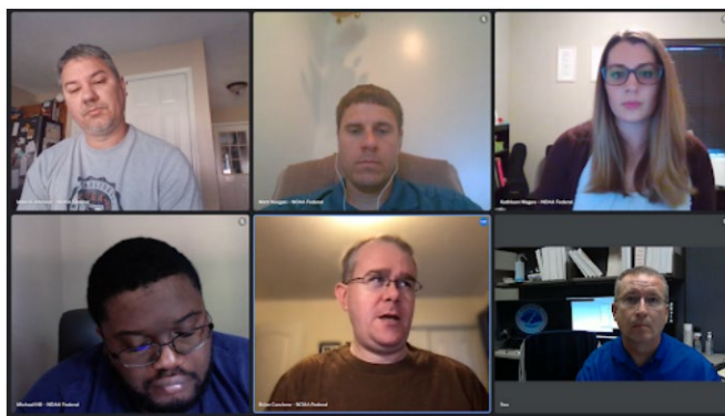
WRT Collaborative Mesoanalysis subteam meeting in July 2021