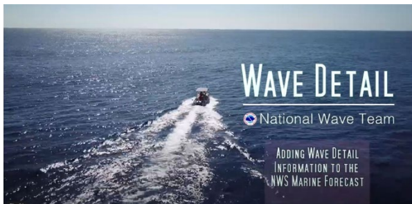
Click the image above to see the project video