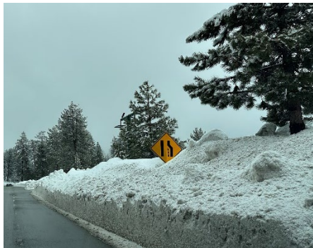
State Highway 18, Arctic Circle, old and new snow in March. This route to Big Bear City was closed for 3 weeks.