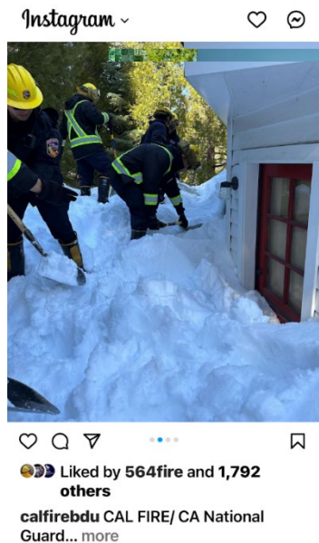
Media and social media coverage of the recovery efforts was daily and extensive.

The response effort resulted in 7800 calls for assistance, nearly 300 rescues from the mountain, 10 home fires due to snow weight damage to gas and meter lines, and almost 2 weeks of state highway closures. Many homes suffered roof damage from the weight of the snow, and the Crestline grocery store had a complete collapse of the structure. The California National Guard and other emergency agencies provided assistance including helicopter drops, and there were five food stations set up across the mountains providing meals for between 500 and 1500 people daily for 3 weeks into early April. SoCal gas had one of the biggest impacts due to the heavy snow, including 400 service calls for gas leaks and damaged pipes. Overall, 100 inches of snow fell at Lake Arrowhead and Crestline at 5000 feet and as much as 140 inches at 7000 feet. Snowfall in 24 hour duration during the two episodes were between 24 and 40 inches. Big Bear Lake received 82 inches of snow, which exceeds their all-time record for seven day snowfall. NWS-specific Caltrans daily briefings predicted a maximum snowfall up to 84 inches at the 6500 foot elevation February 21- 27 and another 32 inches February 28 to March 1. Caltrans reported that 15 million cubic yards of snow was removed and transported off the highways. Ski resorts were unable to operate due to road closures, avalanches, and removal of heavy snow for about a week, with one resort staying closed for almost 2 weeks.