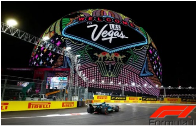
The MSG Sphere welcomes racers and spectators alike to Fabulous Las Vegas