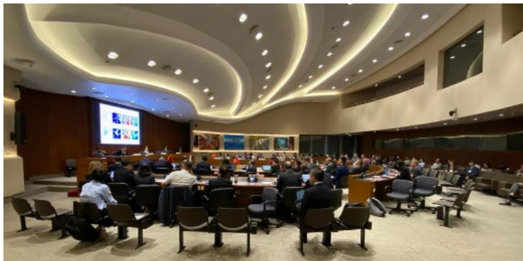
The Session Hall at the United Nations Conference Center in Bangkok, Thailand. More than 120 attendees participated in the IWS 18 from across the Asia-Pacific Region.

The Economic and Social Commission for Asia and the Pacific (ESCAP)/World Meteorological Organization's (WMO's) Typhoon Committee recently concluded its 18th Integrated Workshop (IWS 18) and 4 th Training and Research Coordination Group (TRCG 4) Forum in Bangkok, Thailand. The Typhoon Committee, an intergovernmental body established in 1968, is composed of 14 Member nations, including Cambodia, China, DPR Korea, Hong Kong China, Japan, Lao PDR, Macao China, Malaysia, Philippines, RO Korea, Singapore, Thailand, U.S., and Vietnam. The United States joined the Typhoon Committee in 1998.