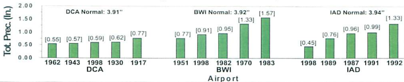
Summer 1998 Daily Cumulative Precipitation at DCA