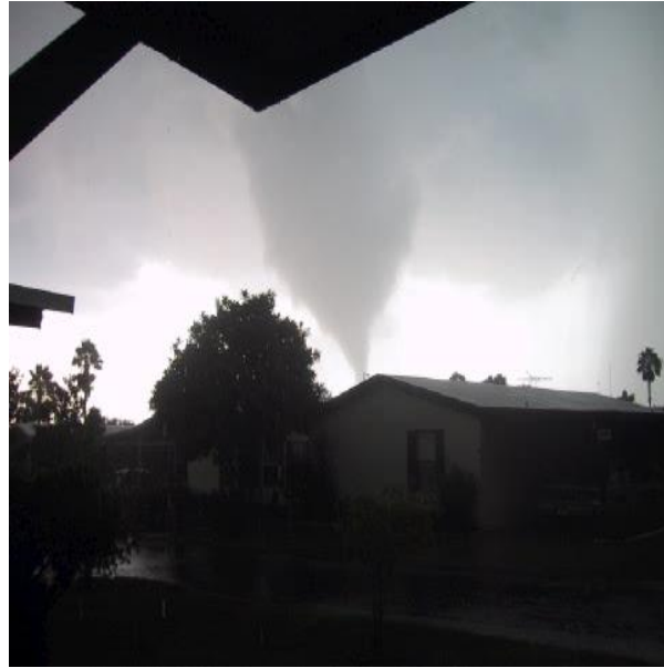
F-1 tornado near Lake Thonotosassa (Hillsborough County) during the evening of July 8th.