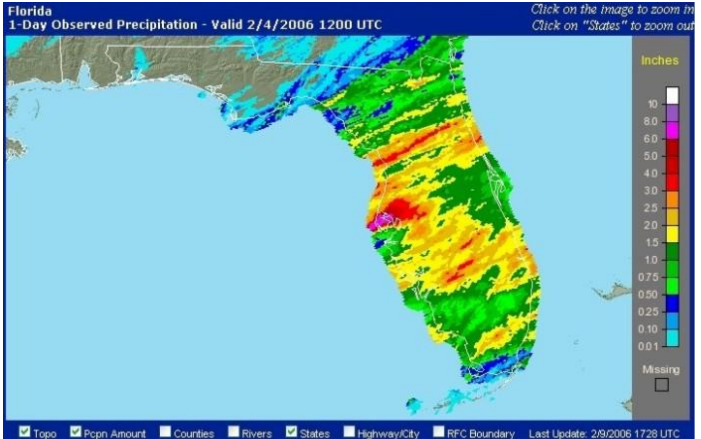
Figure 1. Precipitation Accumulation Estimate, Florida Peninsula, 7 AM EST February 3rd to 7 AM EST February 4th, 2006. (click to enlarge)