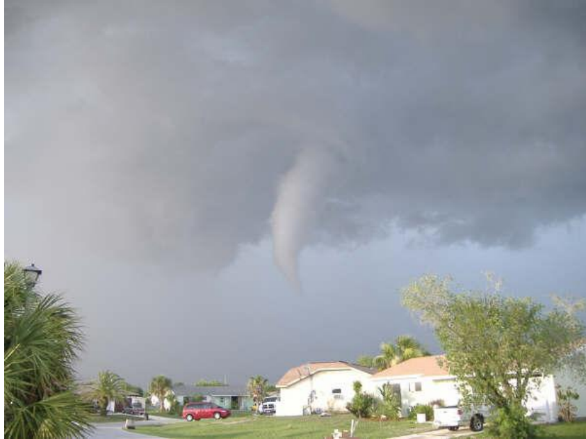
Photograph of funnel cloud over Port Charlotte