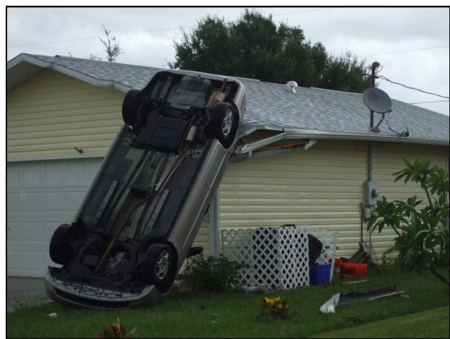
Car flipped up on home due to suction of tornado.