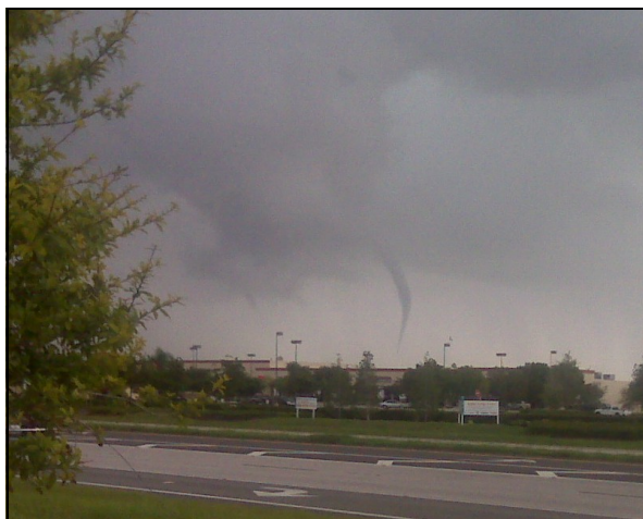
Picture of the very thin tornado.