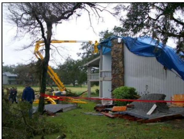
Workers put tarp on home that lost roof