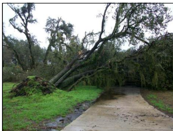
Numerous trees down or ripped apart