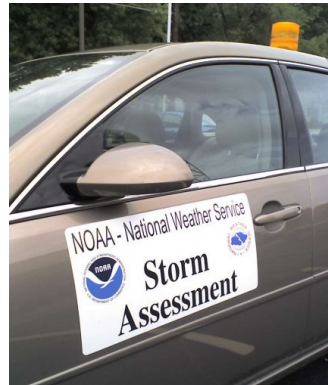
The NWS-Topeka Storm Survey vehicle.

( QRT ), may travel to north-east Kansas to survey the damage. Second, events in which a death or injury