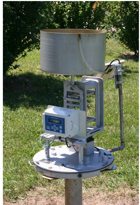
Figure 2: A new Sutron data-logger.

tape punch readers used to transcribe and archive F&P collected data have been identified as high-risk of failure and replacement equipment is no longer available.