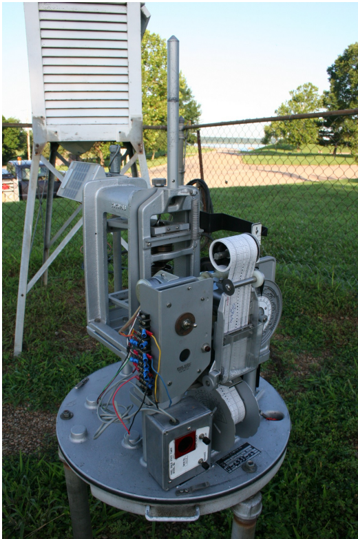
Figure 1: An original F&P gauge.

disk position. This code disk position was recorded on punched paper tape at 15 minute intervals (See Figure 1). At the beginning of a given month, the Cooperative Observer at the site