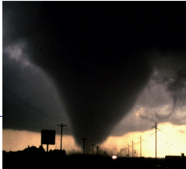
The Dimmitt, TX tornado looking north.

northeast, and passed about a mile to our east. It remained rather large as it passed our position (Pictures on this page).