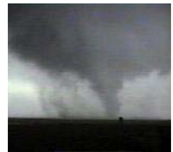
The beginning of the Fiora tornado, just southwest of the town.

around a severe thunderstorm to sample the environment. The instrumentation on each Probe measured wind speed, wind direction, surface pressure, temperature and relative humidity. Probe I was assigned to follow the Forward Flank baroclinic zone (a boundary that often develops between a supercell's precipitation core and the warm moist inflow that feeds the storm) towards the center of the storm's updraft. I was teamed up with the famous