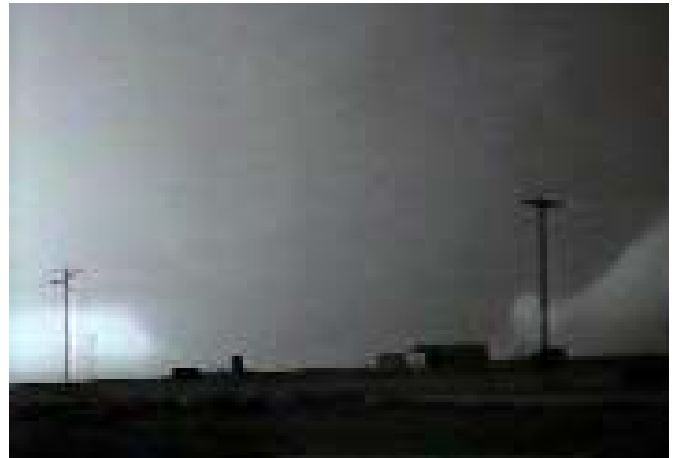
The Friona Tornado. Still picture taken from a video shot by Meteorologist Bill Gargan.

The Vortex Armada left the Severe Storm Laboratory in Norman, OK around 11:00 AM with an initial target of the dry line about 50 miles southwest of Amarillo, TX. During our journey west on I-40, we entered the eastern Texas Panhandle and noticed that storms had already formed on the east side of the axis of deep gulf moisture. Initially these storms looked to have elevated bases but one storm right along the interstate about 40 miles east of Amarillo developed a rotating wall cloud that we sat and