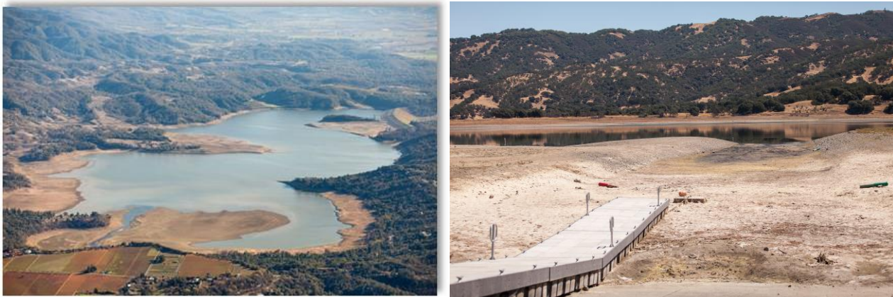
Lake Mendocino: Aerial view and plane view