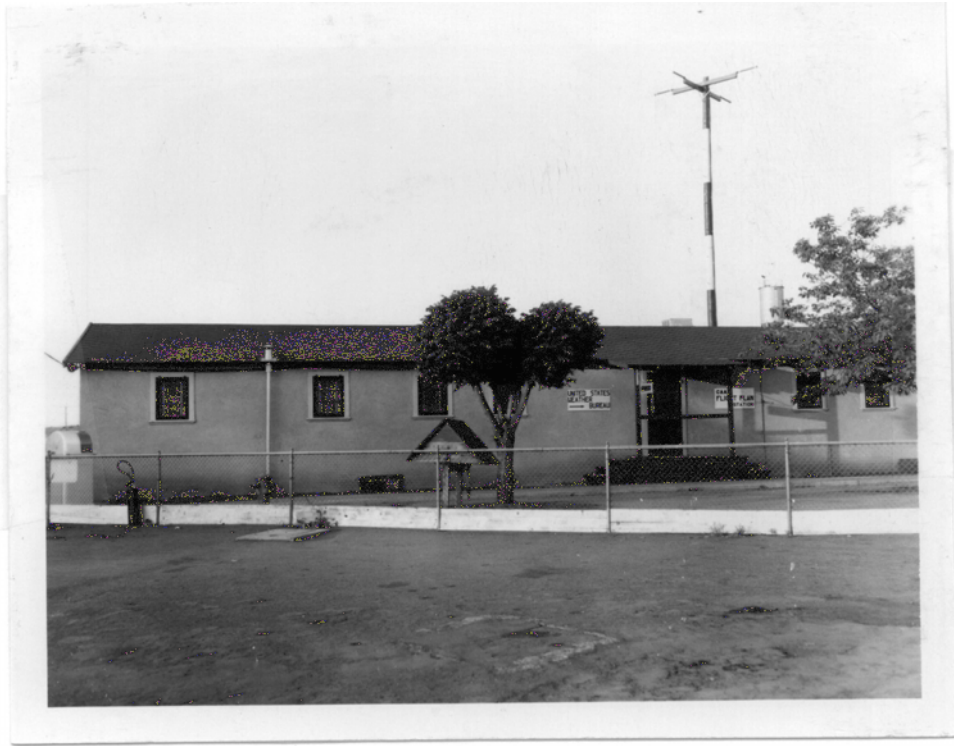
Figure 2 – The National Weather Service Office in Bakersfield, California – photo taken on April 21, 1947 (Photo courtesy NCDC).