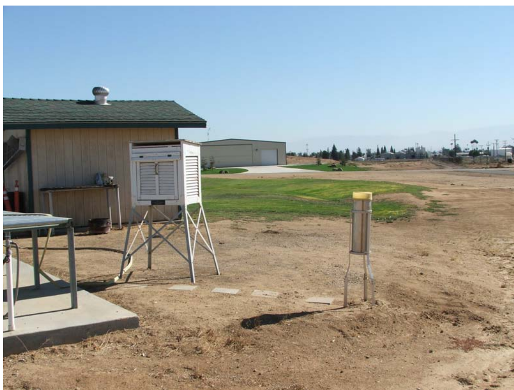
Figure 11 – The cooperative station at the Kern County Fire Department at Meadows Field in the fall of 2007.