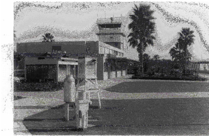
Figure 5 – Weather instruments at Meadows Field on January 15, 1964. An 8 inch rain gauge, a weighing rain gauge and a cotton region shelter are noted in this photograph (Photo courtesy NCDC).

Observations continued at the Airport Administration Building until March 10 th , 1958, then moved to the Kern County Air Terminal at what is now called Meadows Field. This move was 1500 feet west-northwest. The office was within one week of closing in June