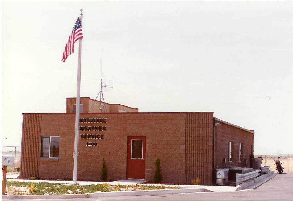
Figure 7 – The new National Weather Service Office at 1400 Boughton Drive, Bakersfield, California in 1984.