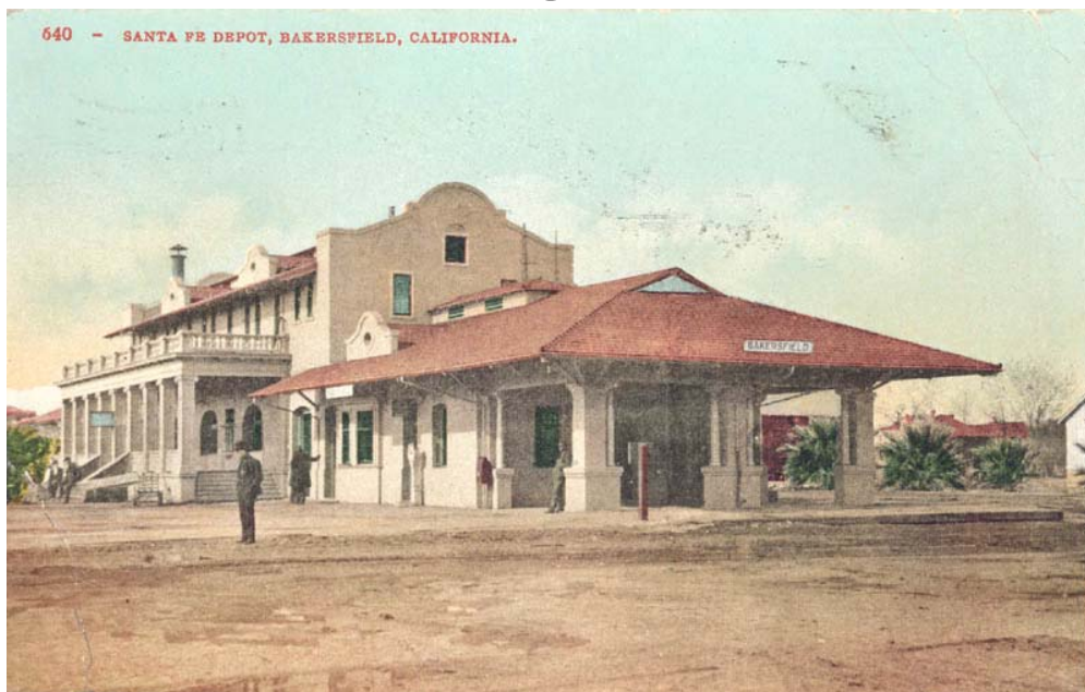
Figure 1 – The Santa Fe Rail Depot in Bakersfield.

In 1926, the Daniel Guggenheim Committee on Aeronautical Meteorology set up a fund for 30 experimental weather stations between Los Angeles and San Francisco. The idea was to aid pilots as they flew between these two locations. Bakersfield was one of these experimental stations, with the observers working from the Airport Administration Building at the Kern County Airport. The station's purpose was to relay surface weather information, three times a day, to meteorologists in both Los Angeles and San Francisco. This information was then relayed to pilots as forecasts and in-flight updates.