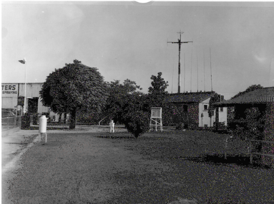
Figure3 - Weather instruments at the National Weather Service Office in Bakersfield. Two rain gauges and a cotton region shelter can be in this photograph taken in July 1950.