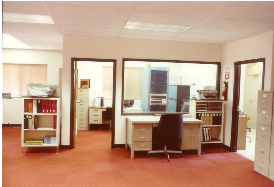
Figure 9 – The AFOS mainframe was housed in this room at WSO Bakersfield. In the front on the bookshelves is a collection of many of the climate records and important weather events for Bakersfield taken over the years.

With the commissioning of ASOS several changes occurred with the climate records of Bakersfield. Due to the changes in methodology in observing sky cover by ASOS compared to human observers, records of cloud cover were discontinued. In addition, ASOS is a totally automated system and can not record how much snow, ice pellets or hail accumulates. Any accumulating snowfall, ice pellets or hail is measured by a Kern County Fire Department unit on the airport grounds. In addition, the Kern County Fire Department also has a temperature sensor and standard rain gauge to record daily weather observations. These instruments are in place to be used as the official back-up for temperature and precipitation data in the event that equipment issues arise with ASOS and a need for back-up climate information becomes necessary.