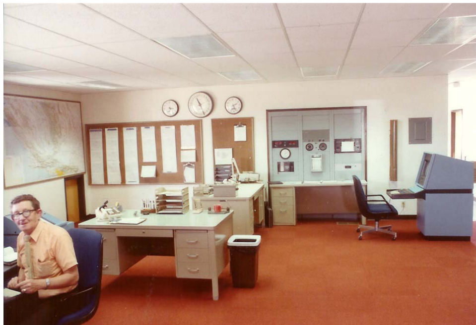
Figure 8 – The inside of WSO Bakersfield at the new Boughton Drive facility in 1984. Met-Tech Don Anderson is at work on the left. In the center background is the H083 display which let staff know what the latest readings were for temperature, pressure, humidity and wind. This information was used when it was time to take surface observations and also winds up in the climate data. An AFOS computer can be seen at right.