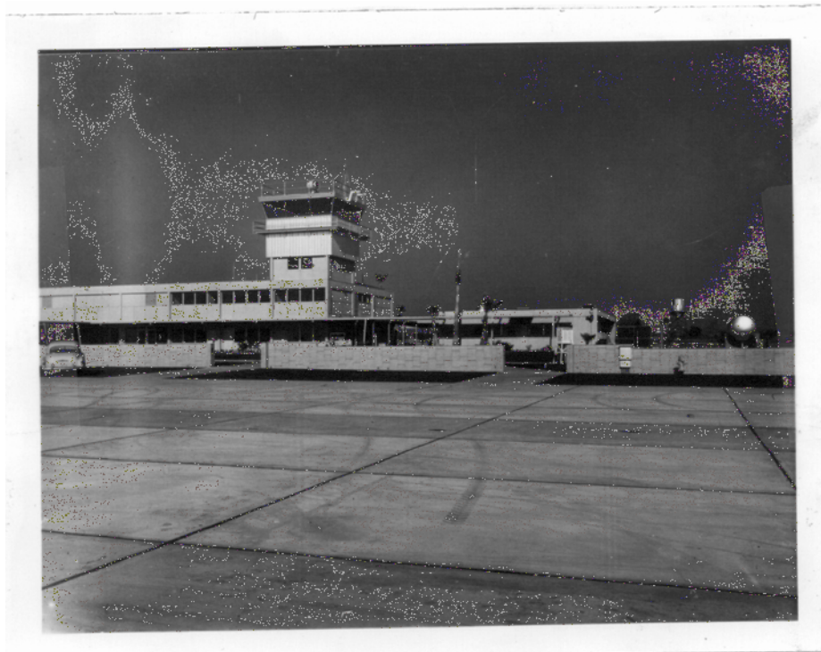
Figure 4 – Weather instruments at Bakersfield in early 1958. A cotton region shelter can be noted in the center of this photograph.