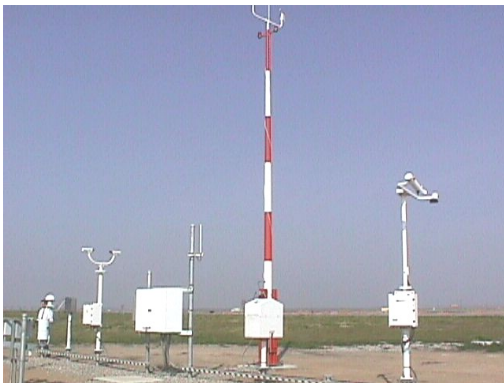
Figure 10 – The ASOS at Meadows Field in Bakersfield (Photo courtesy NWS Hanford Electronics Technicians staff).