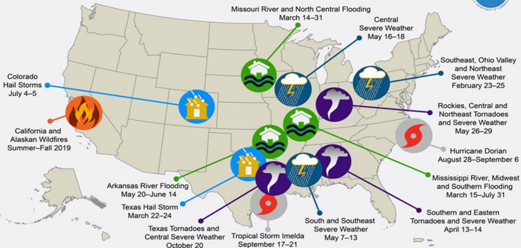
This map denotes the approximate location for each of the 14 separate billion-dollar weather and climate disasters that impacted the United States during 2019.